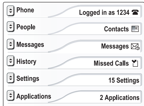
Mitel 5235 IP Phone – Overview Screen

The overview screen on the 5235 IP Phone offers total communications status and access to numerous telephony setting and applications features. The overview screen provides a consistent user experience that builds on the award-winning Mitel Your Assistant™ desktop application.