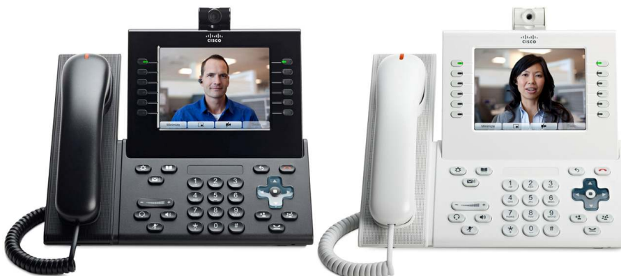
Figure 1. Cisco Unified IP Phone 9971