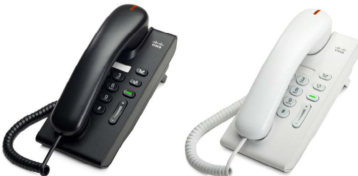
Figure 1. Cisco Unified IP Phone 6901

Cisco® Unified Communications Solutions enable collaboration so that organizations can quickly adapt to market changes while increasing productivity; improving competitive advantage through speed and innovation; and delivering a rich-media experience across any workspace, securely and with optimal quality.