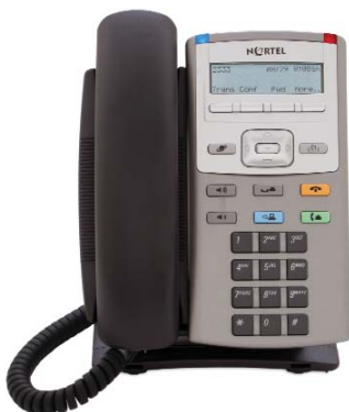
Nortel IP Phone 1110